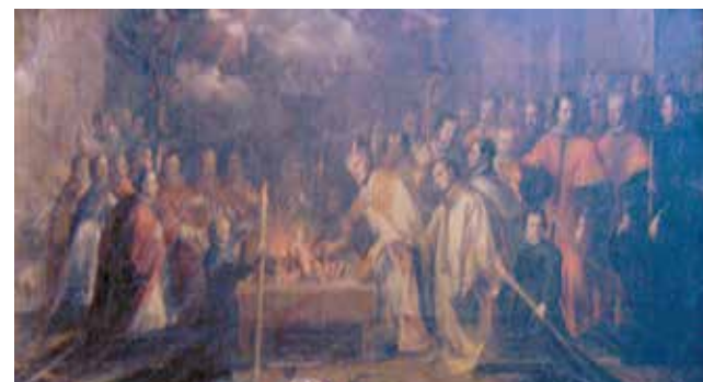
Ancient painting in the Cathedral of the See representing the miracle in the Chapel of Little Saint Dominic of the Val. There is also on the wall facing the chapel, a marble plaque describing the miracle