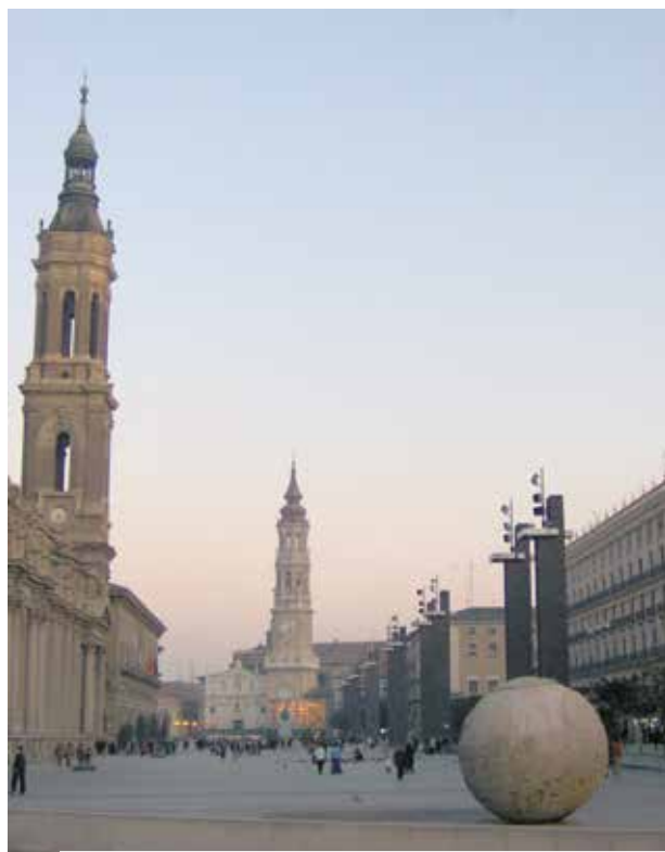
Cathedral of the See, Zaragoza

In the consecrated Host, stolen by a woman of Zaragoza to use in making a love potion, the Baby Jesus appeared. In the town hall archives of the city of Zaragoza is preserved the document that describes the miracle in detail. And in the cathedral, next to the chapel of “San Dominguito del Val” there is a painting accurately depicting the marvelous event.