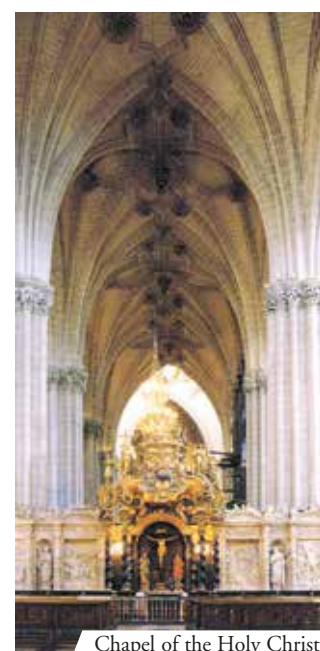
Chapel of the Holy Christ