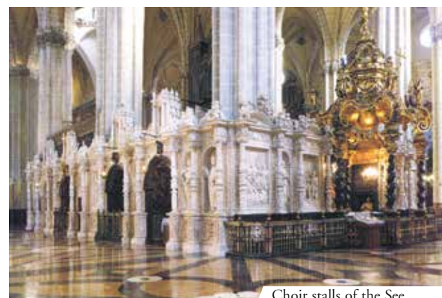
Choir stalls of the See