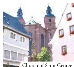
Church of Saint George