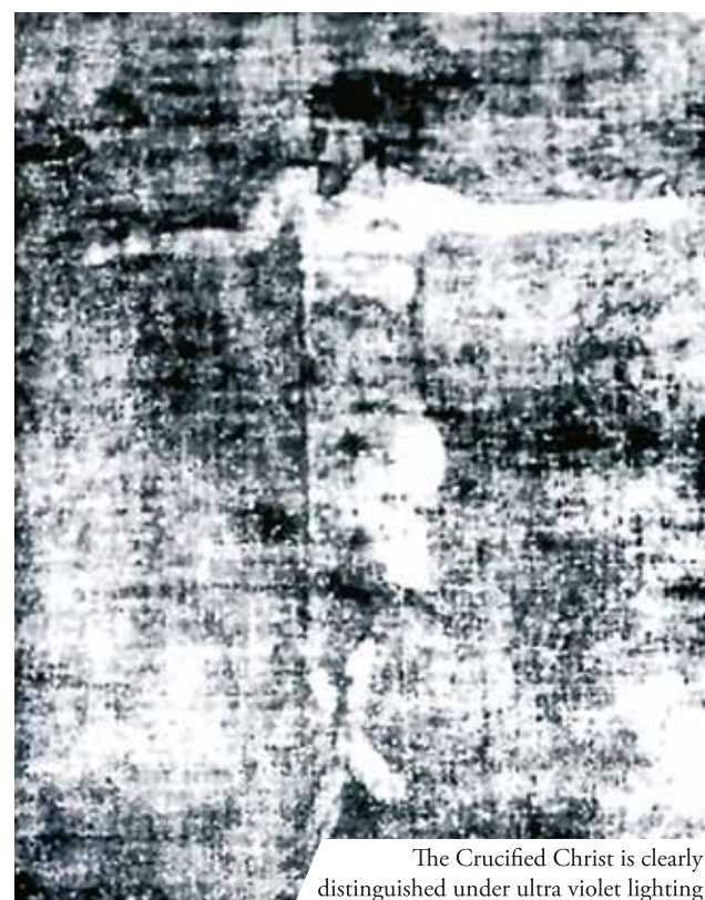
The Crucified Christ is clearly distinguished under ultra violet lighting

The actual basilica was constructed between 1698 and 1728 by Franz Lothar von Schonborn, the Archbishop of Mainz. In 1962, Pope John XXIII elevated the church to a minor basilica. Augustinian monks have protected the basilica since 1938.