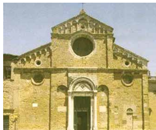
Church of Saint Francis

Church of Saint Francis. We also have some municipal acts preserved in the municipal library of Volterra. A soldier from Florence entered the Cathedral Church and immediately went to the tabernacle, from which he took the ciborium with consecrated Hosts inside, along with many sacred objects. As soon as he left the Church, taken by a very strong hatred against Jesus in the Eucharist, the soldier flung the ciborium against one of the external walls of the Church and all the Sacred Hosts came out from it, which - as if held by an invisible hand - were elevated into the air, all radiant with light. The soldier fell to the ground out of fright, and having repented, began to cry. Many were the witnesses who were present at this marvel.