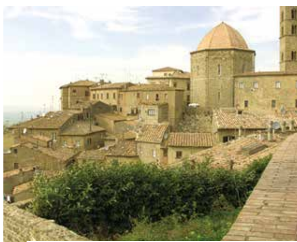
View of Volterra