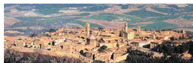
View of Volterra