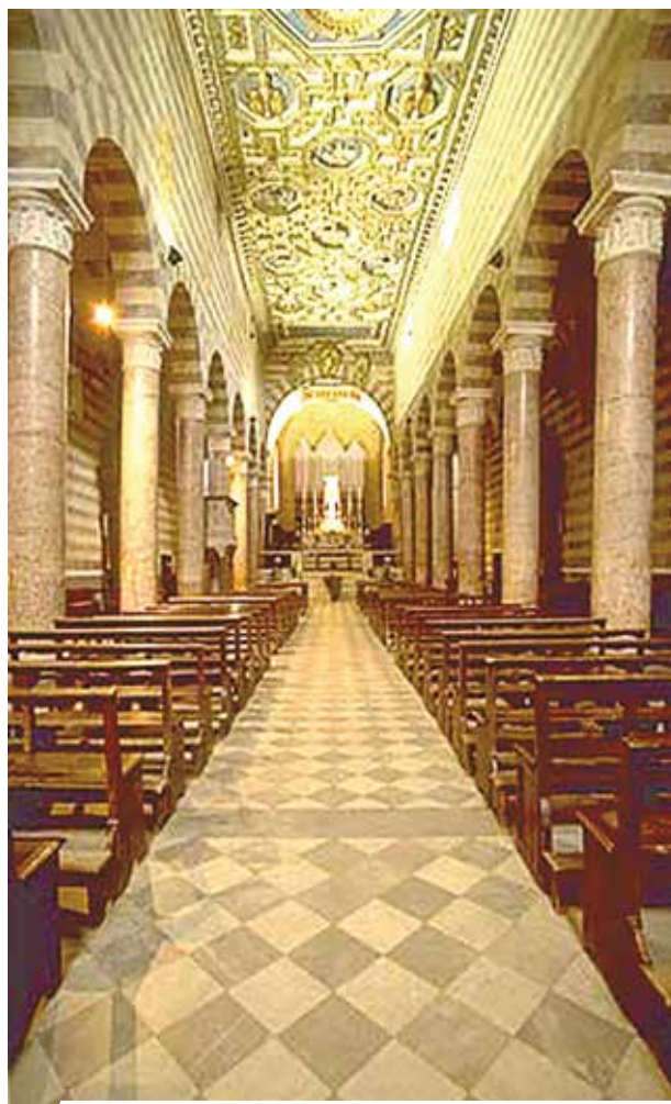
Interior of the Cathedral

In 1472, during the war that broke between Volterra and Florence, a soldier from Florence, having entered in the Cathedral of Volterra, managed to take possession of the precious Ciborium of ivory which contained numerous consecrated Hosts. As soon as he left the Church, taken by a fit of fury against the sacramental Jesus, he threw the ciborium with its precious content against a Church wall. All the Hosts fell from it, and - illuminated by a mysterious light - elevated into the air and remained suspended for a long time. Many are the witnesses that were present at the event.