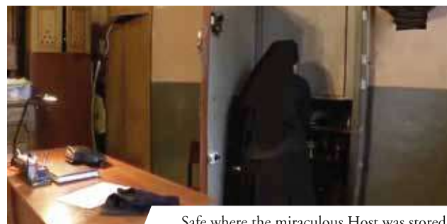
Safe where the miraculous Host was stored