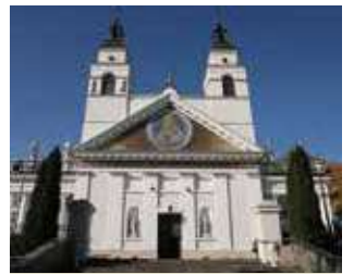
Church dedicated to Saint Anthony in Sokółka