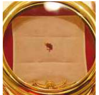
The fragment of the partially dissolved Host with the blood colored substance emanated from its interior is the relic that was placed on the white corporal with an embroidered red cross.