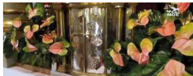
Tabernacle where miraculous Host that fell to the ground was first stored