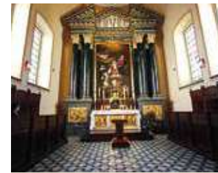
Interior Chapel where the precious Relic is kept