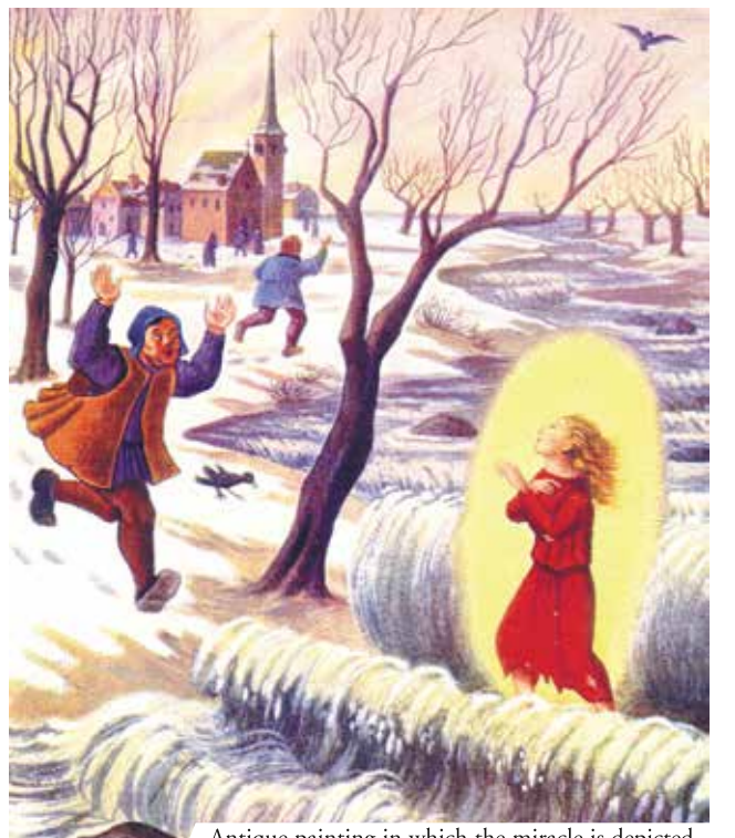
Antique painting in which the miracle is depicted

From the time that our young shepherd girl became motherless, her father remarried a woman who, from the very start, demonstrated hostility towards her because Germaine's face was full of acne and was not easy to look at. The stepmother, who could not stand the sight of Germaine's face, convinced her husband to make Germaine live in the small basement under the steps. The poor girl found herself so completely isolated in that basement that the rats were often her only companions. Germaine, however, was very close and devoted to the Lord and in particular loved the Blessed Sacrament and prayed and visited on a daily basis.