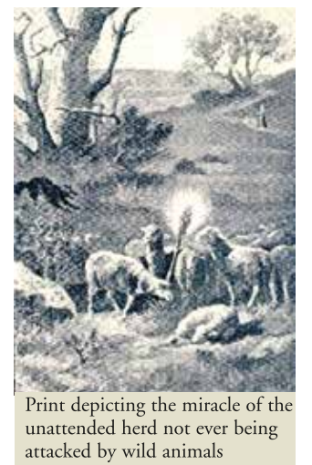
Print depicting the miracle of the unattended herd not ever being attacked by wild animals