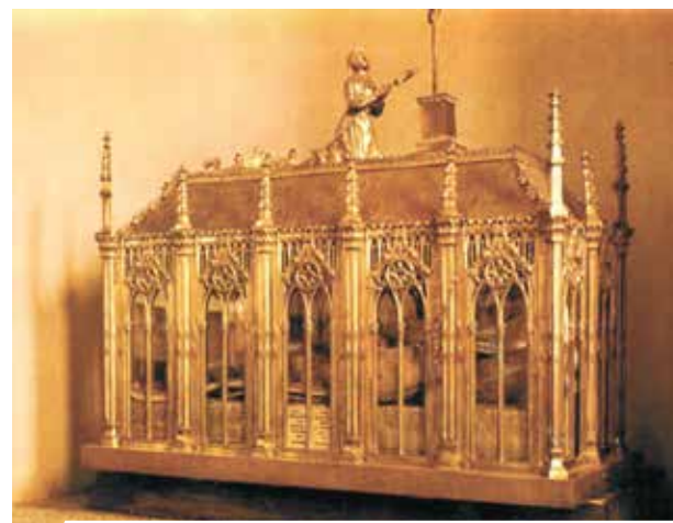
Tomb of St. Germaine