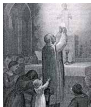
Ancient print of the miracle