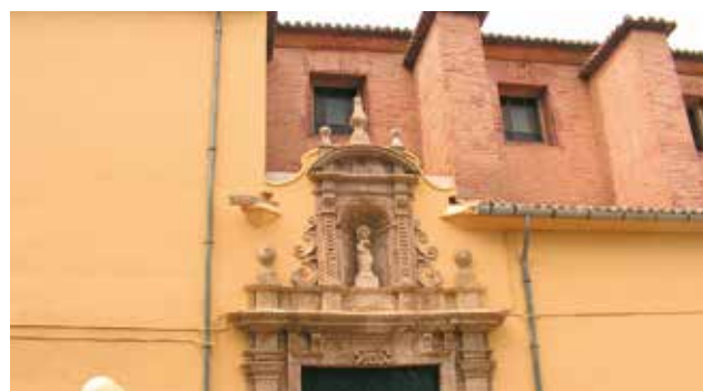
The church where the miracle took place