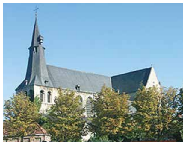
Church of St. James in Louvain