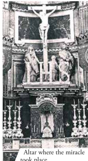
Altar where the miracle took place