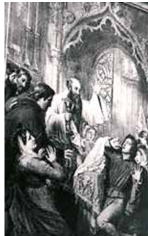
Painting depicting the miracle, Church of St. James, Louvain