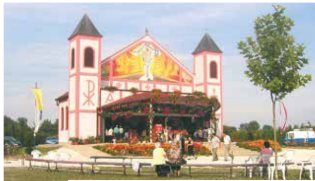
Shrine of the Miracle of the Precious Blood, Ludbreg