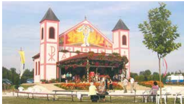
Shrine of the Miracle of the Precious Blood, Ludbreg

The relic of the Blood has remained perfectly intact and is kept in a precious monstrance made at the request of Countess Eleonora Batthyany Strattman in 1721.