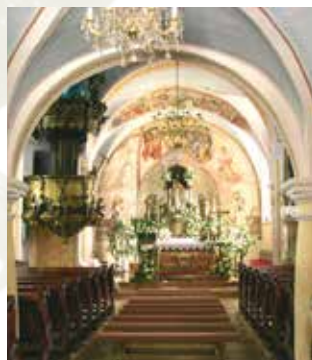
Interior of the chapel of the Batthyany family castle