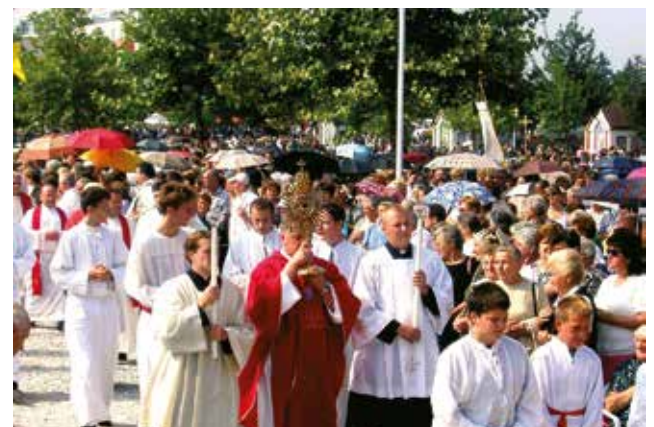
Procession held every year in September, during the week when the miracle called Sveta Nedilja is celebrated