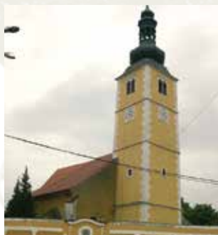
The chapel of the Batthyany family castle where the miracle occurred