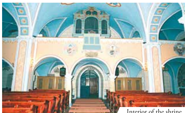
Interior of the shrine