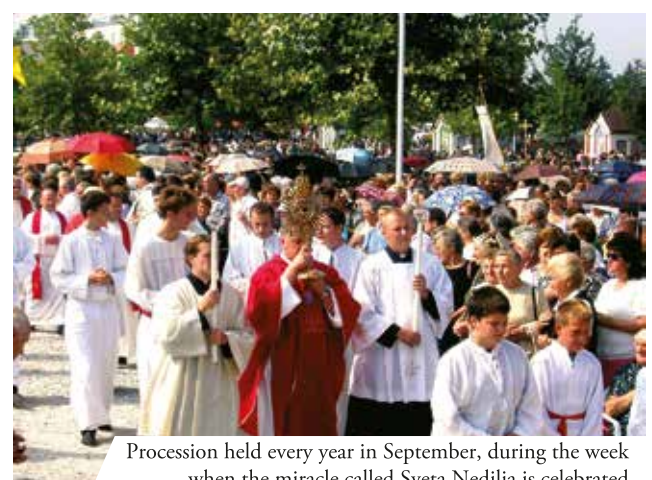
Procession held every year in September, during the week when the miracle called Sveta Nedilja is celebrated