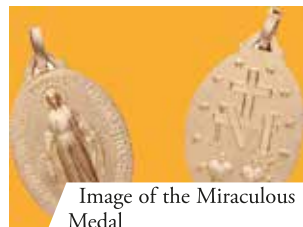
Image of the Miraculous Medal