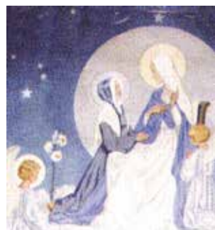
Fresco in the Church of Rue du Bac showing Catherine with the Virgin Mary