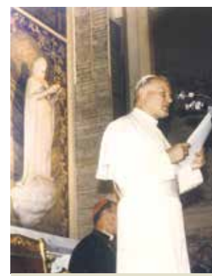
Pope John Paul II on a visit to the chapel in the church of Rue du Bac in Paris on May 31, 1980