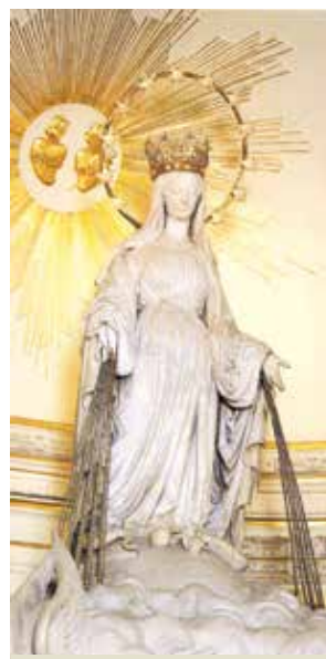
Statue of Mary as she appeared to Saint Catherine with the globe, rays, and the Sacred Heart of Jesus