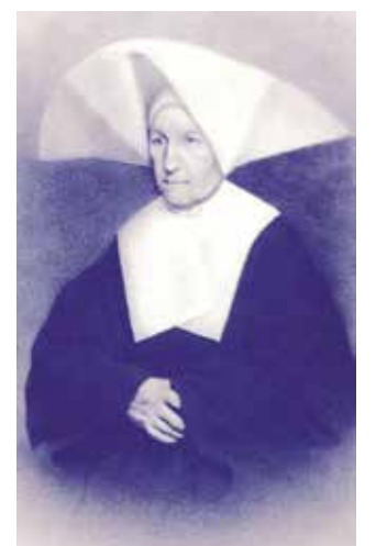
Saint Catherine Labouré

Catherine herself described the moment of the apparition: “While making Eucharistic Adoration in deep silence, I seemed to hear a sound coming from the side of the tribune, like the rustle of a silk dress. I got up and looked and saw the Holy Virgin. She was of medium build and indescribably beautiful. A white veil fell from her head to her feet and rested upon a half-globe. Her hands, raised to waist level in a natural position, held another small golden globe with a gold Cross on top. Her eyes looked beseechingly towards Heaven. While I was intent on contemplating her, the Holy Virgin lowered her eyes towards me and said these words: ‘This globe that you see represents the entire world, in particular France, and every single person.’ And the Virgin added, ‘The rays symbolize the graces shed on those who petition me’, making me understand how sweet it