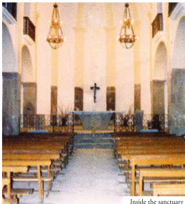
Inside the sanctuary

The parish priest of this town doubted the Real Presence of Christ in the Eucharist. One day in the year 1010, while celebrating Mass, the miracle occurred: the wine contained in the chalice was converted entirely into live Blood. At present, the Sacred Relics are preserved in a gothic reliquary from 1426 that contains the altar cloth spotted with Blood, and other relics given from Pope Sergius IV to Saint Ermengol.