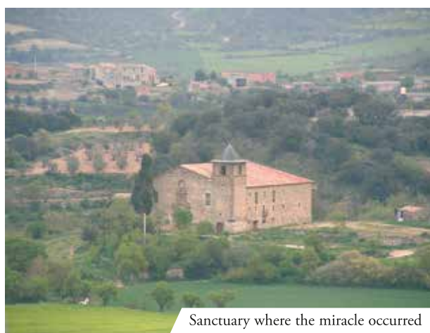
Sanctuary where the miracle occurred