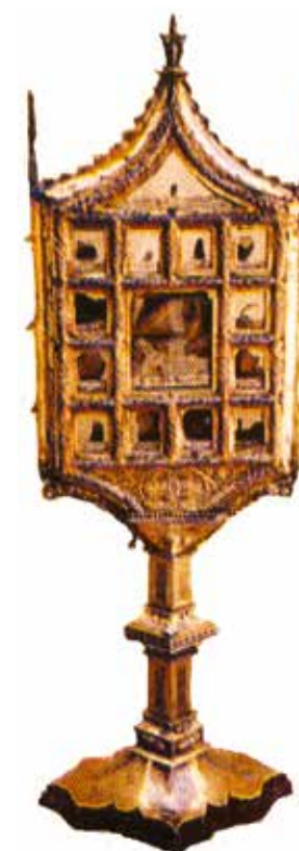
Monstrance containing the relics of the miracle