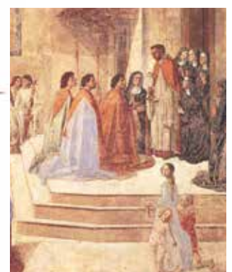
Fresco in the basilica depicting the first miracle that took place in 1230, showing the priest Uguccione carrying the Blood in procession