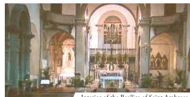
Interior of the Basilica of Saint Ambrose

The first miracle took place on December 30, 1230. A priest named Ugucione, having finished celebrating Mass, did not realize that several drops of consecrated wine remained in the chalice and had turned into Blood. The historian Giovanni Villani gives a precise description: "A day later, taking up the chalice he found living Blood coagulated [...] and this was shown to all the women of the monastery, and to all the locals who were present and to the bishop and to all the clergy and then it was revealed to all the Florentines, who gathered with great devotion to see. He took the Blood from the chalice and put it in a crystal cruet and again showed it to the population with great reverence." Bishop Ardingo of Pavia ordered that the reliquary be brought to him. He kept it for several weeks before returning it to the sisters of the monastery who took care of it near the Church of Saint Am-