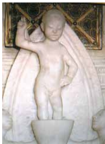
Details of the tabernacle where the reliquaries of the two Eucharistic miracles are stored