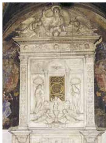
Precious tabernacle, done by Mino da Fiesole, where the reliquaries of the two miracles are kept