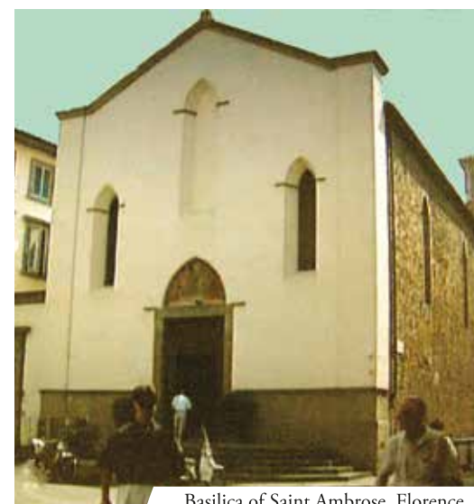
Basilica of Saint Ambrose, Florence