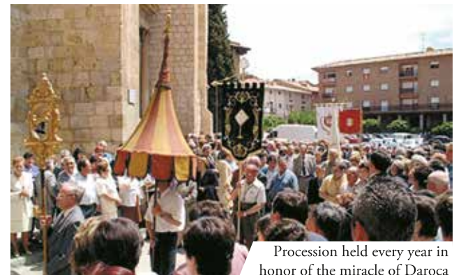
Procession held every year in honor of the miracle of Daroca