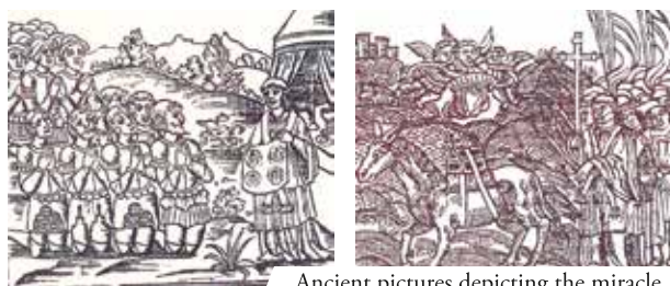
Ancient pictures depicting the miracle