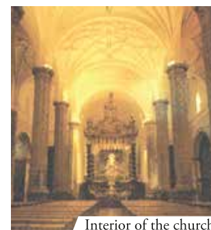
Interior of the church