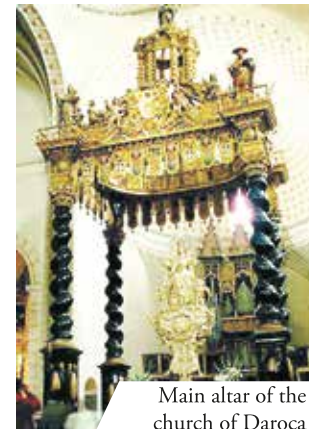
Main altar of the church of Daroca