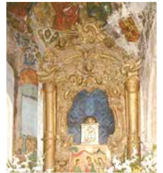
Chapel where the Santa Hijuela (Pall) is preserved, Carboneras