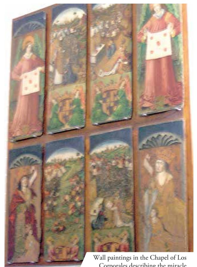
Wall paintings in the Chapel of Los Corporales describing the miracle