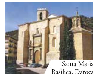
Santa Maria Basilica, Daroca