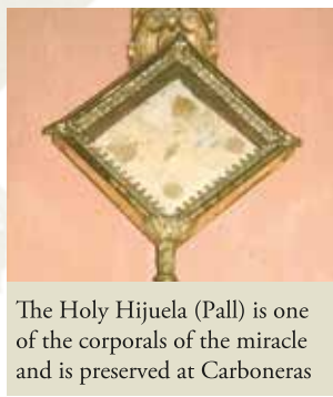
The Holy Hijuela (Pall) is one of the corporals of the miracle and is preserved at Carboneras