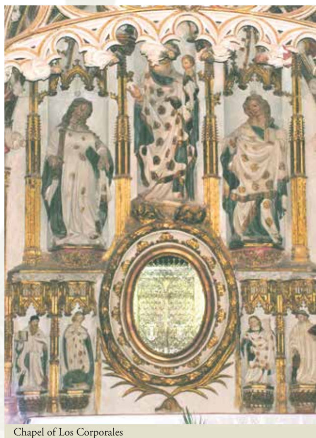
Chapel of Los Corporales