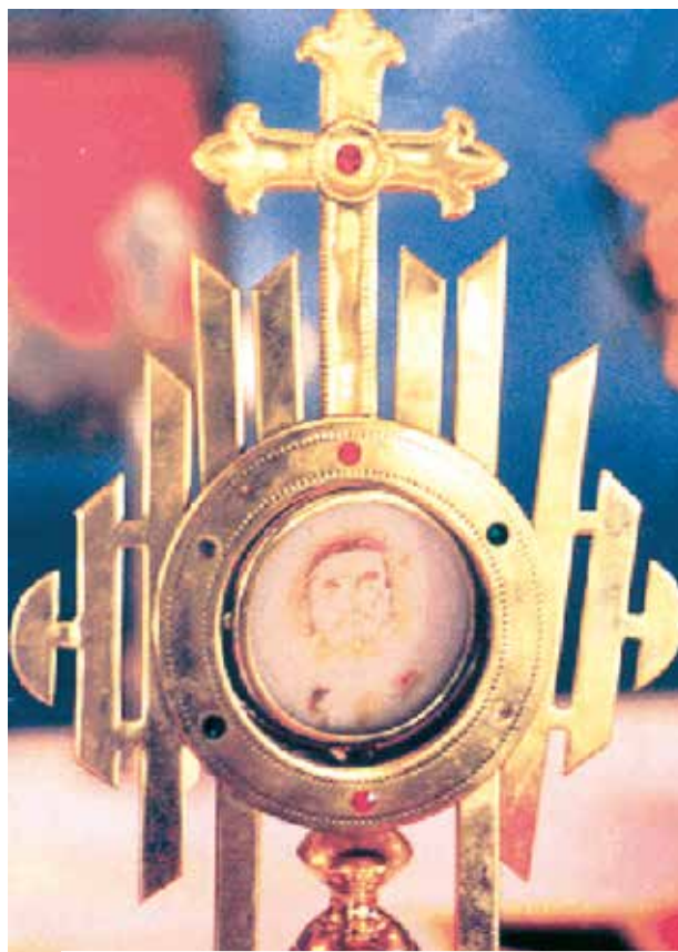
Monstrance containing the Particle in which the image appeared