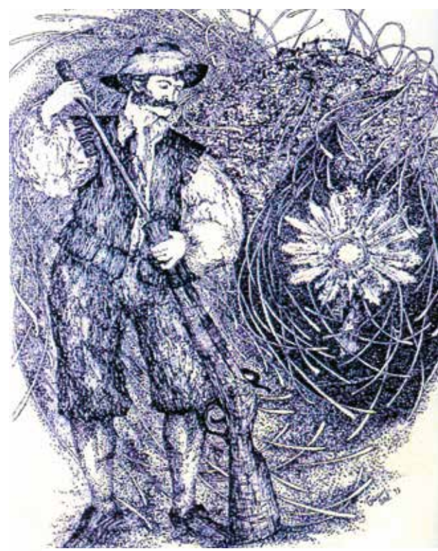
An antique print (ca. 18th Century) depicting the miracle