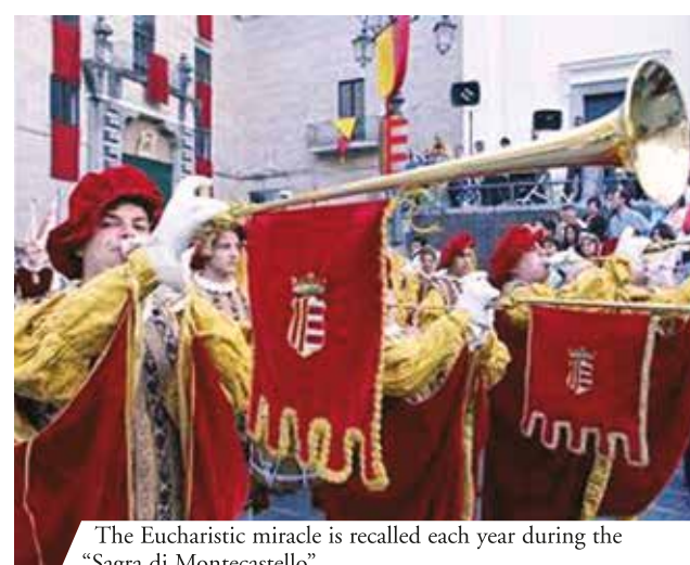
The Eucharistic miracle is recalled each year during the “Sagra di Montecastello”