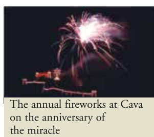
The annual fireworks at Cava on the anniversary of the miracle