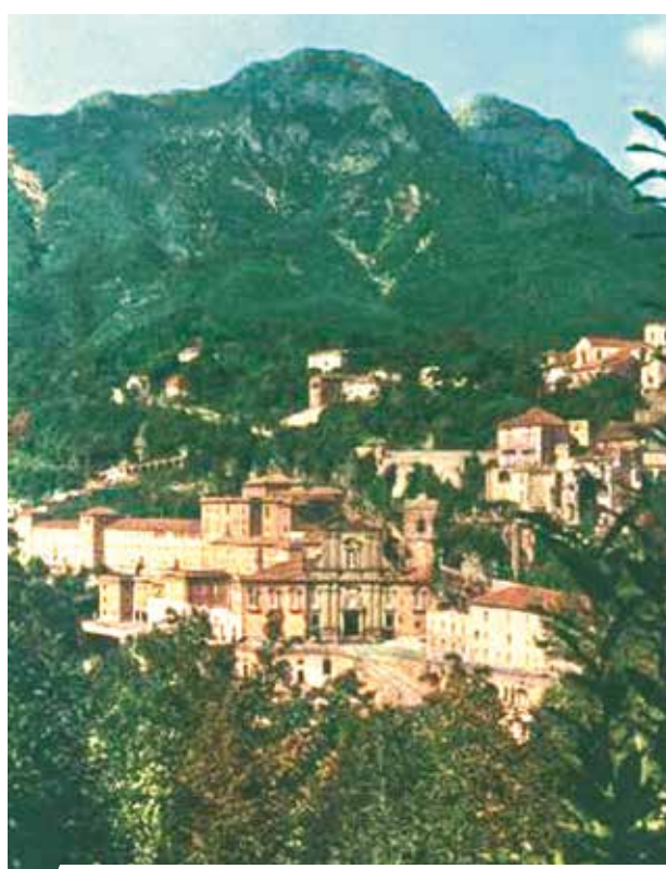
Panoramic view of Cava dei Tirreni