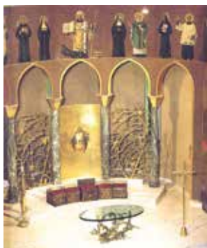
Upper Basilica with presbytery by the sculptor Manzu