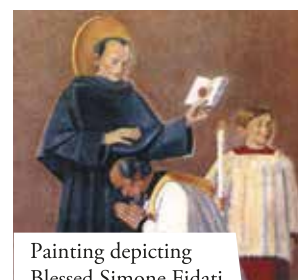
Painting depicting Blessed Simone Fidati