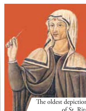
The oldest depiction of St. Rita

In the act of recognition of the relic of the Eucharistic miracle of Cascia in 1687, a text was also reported of a very ancient code of the priory of St. Augustine in which are described numerous pieces of information regarding the miracle. Beyond this information, the episode is also mentioned in the Communal Statutes of Cascia of 1387 where it was ordered that "every year on the Feast of Corpus Christi, the authorities, the counsels, and the people of Cascia, should meet in the Church of St. Augustine and follow the priest who should carry the venerable relic of the Most Holy Body of Christ in procession through the city. In 1930, on the occasion of the sixth centenary of the event, a Eucharistic Congress was celebrated at Cascia