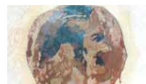
Enlarged reproduction of the face which appeared in the left-hand page