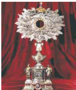
Ancient monstrance which contained the relic of the miracle