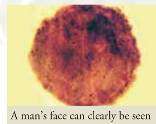
A man's face can clearly be seen