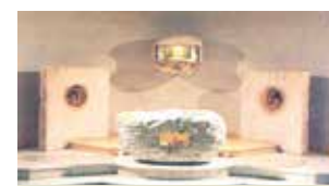
Chapel where the relic is kept in the Lower Basilica