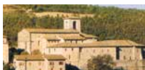
Priori of St. Augustine in Cascia