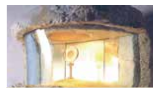
Tabernacle of the Eucharistic miracle