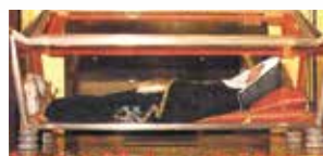
Urn containing the body of St. Rita which is preserved intact