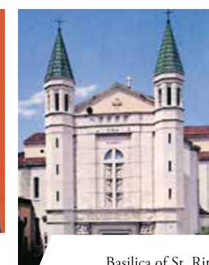
Basilica of St. Rita

for the entire diocese of Norcia; a precious and artistic monstrance was consecrated, and the entire historical documentation of the miracle was published.