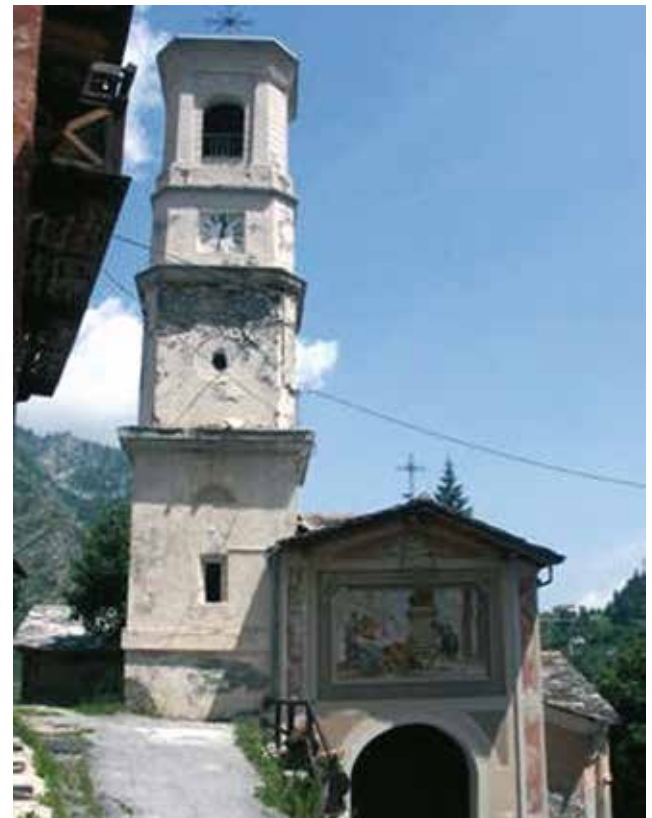
Parish Church of Canosio