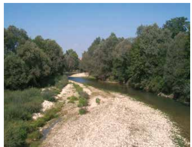
The Maira River

Canosio is a small village in the region of Val Maira, in the Diocese of Saluzzo. In 1630, its townspeople had grown cold in their religious observance due to the spread of the Calvinistic heresy. A day after the feast of Corpus Christi, the river at Maira flooded because of a torrential rainfall. The flood waters were so violent and powerful that some massive stones were dislodged from the mountain and threatened to destroy the valley and the village itself!