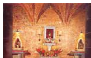
Sanctuary of the Holy Blood, Reliquary Chapel