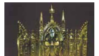
Reliquary of the True Cross