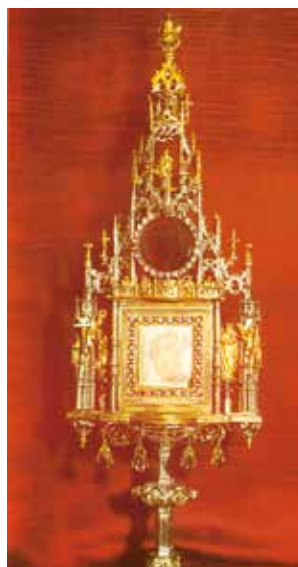
Reliquary of the Eucharistic miracle, corporal stained with Blood