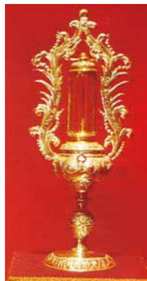
Reliquary of a Thorn from the Crown of Jesus