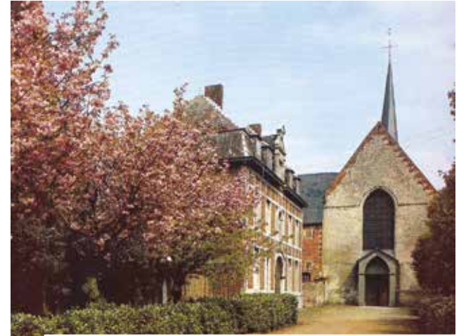
Premonstratensian Abbey, Chapel of the Holy Blood