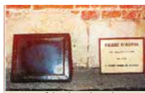
Picture of the altar where the curé of Haut-Ittre celebrated the Holy Mass where the miracle was verified