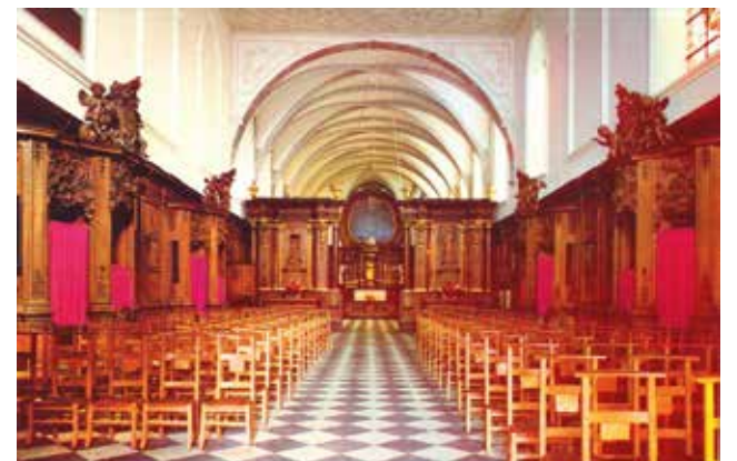
Interior of the Chapel of the Holy Blood