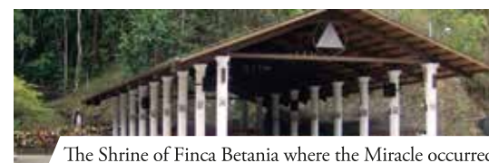
The Shrine of Finca Betania where the Miracle occurred