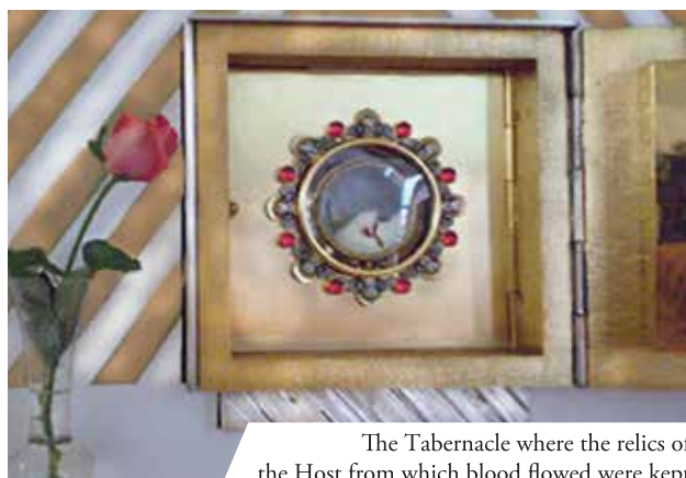
The Tabernacle where the relics of the Host from which blood flowed were kept