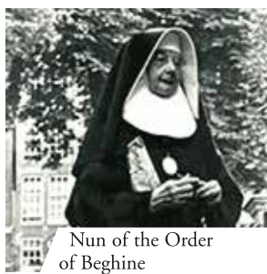
Nun of the Order of Beghine