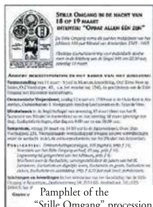
Pamphlet of the "Stille Omgang" procession