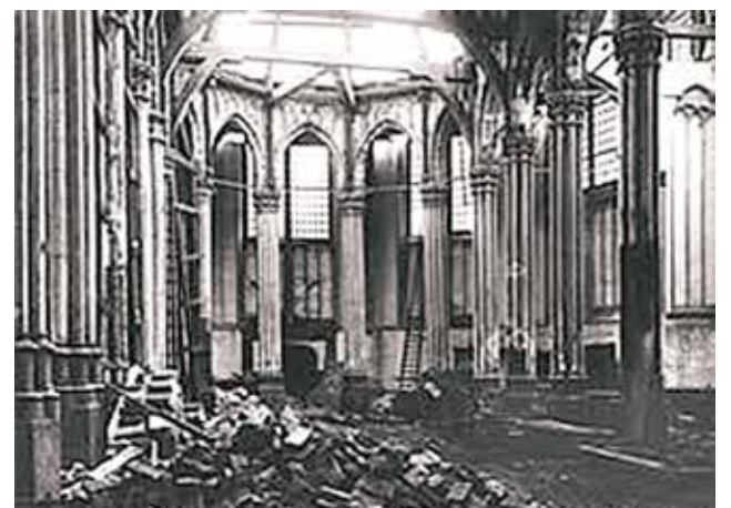
The chapel of the church was destroyed again in 1908