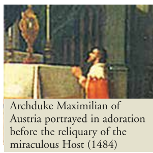
Archduke Maximilian of Austria portrayed in adoration before the reliquary of the miraculous Host (1484)