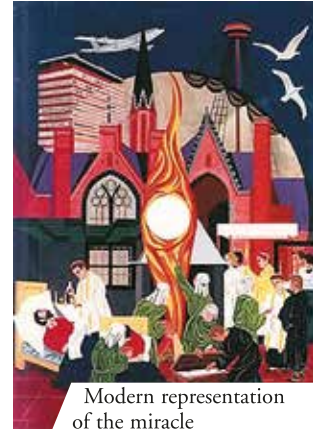
Modern representation of the miracle