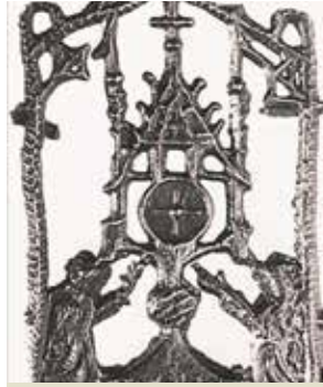
Sculpture of the ancient monstrance which contained the miraculous Host