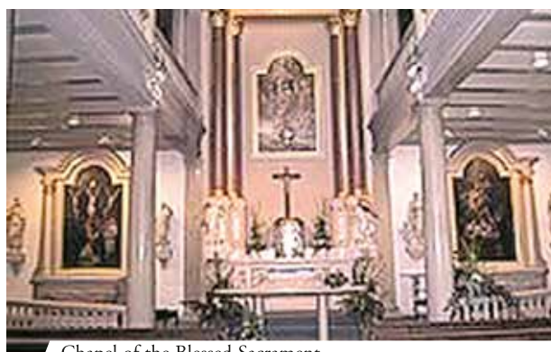
Chapel of the Blessed Sacrament