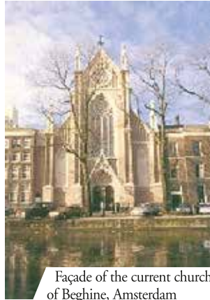
Façade of the current church of Beghine, Amsterdam

In 1452 the chapel was destroyed by a fire, but strangely the monstrance containing the miraculous Host remained intact.