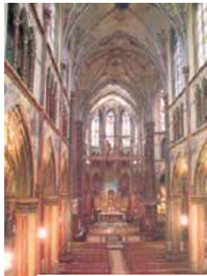
Interior of the church