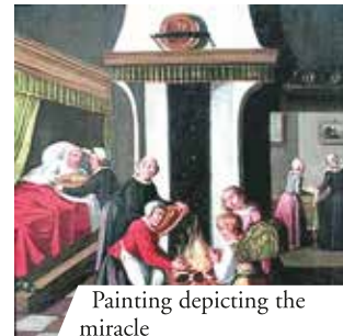
Painting depicting the miracle