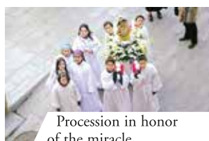
Procession in honor of the miracle