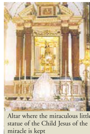
Altar where the miraculous little statue of the Child Jesus of the miracle is kept