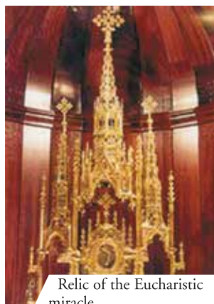
Relic of the Eucharistic miracle

The Eucharistic miracle that took place in Alcoy in the year 1568 regards the miraculous retrieval of some consecrated Hosts that had been stolen. The miracle is still remembered every year by the inhabitants of Alcoy in a festival that is celebrated on the feast of Corpus Christi. The house of the man who committed the sacrilege was turned into an oratory and can be visited to this day.