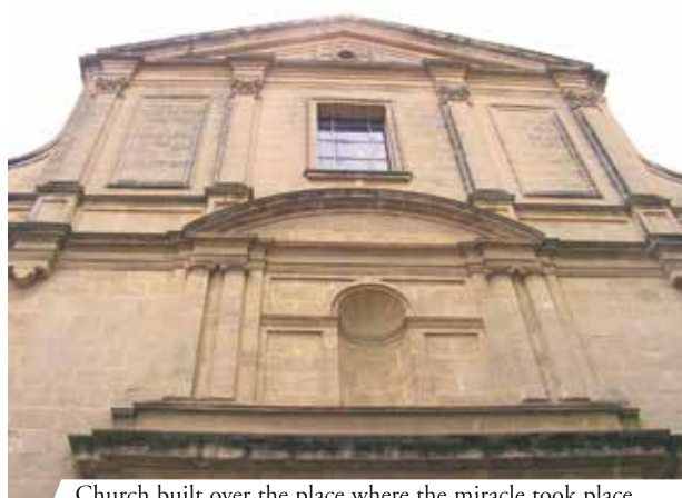
Church built over the place where the miracle took place