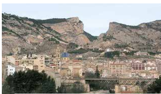
View of Alcoy