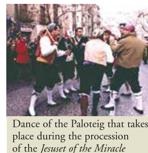
Dance of the Paloteig that takes place during the procession of the Jesuset of the Miracle